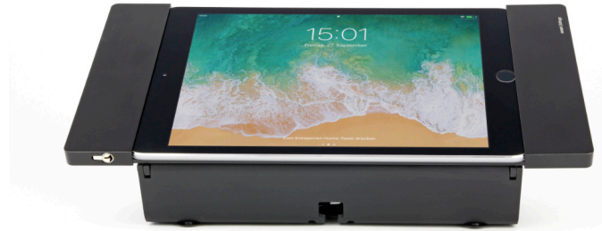
Illustration mit sDock Fix mini und iPad