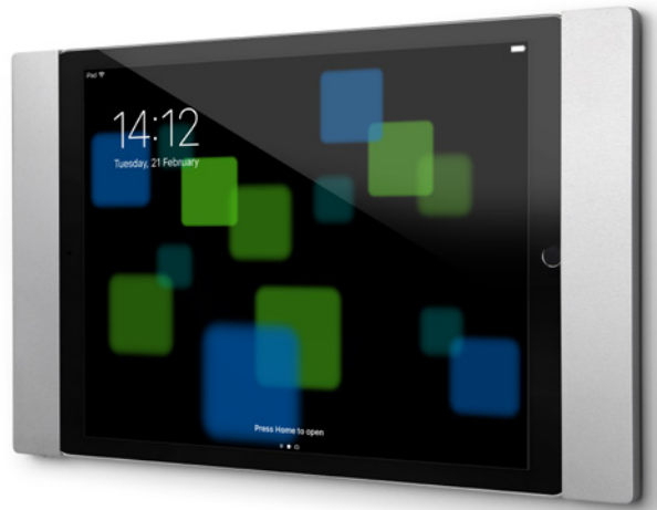
Illustration with iPad Pro