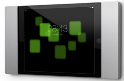
Illustration with iPad mini